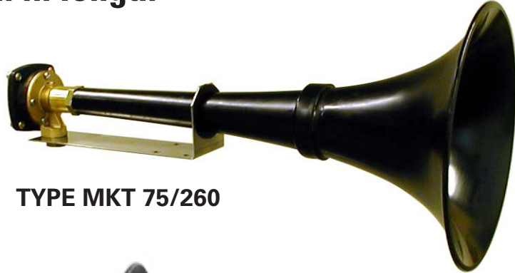
TYPE MKT 75/260