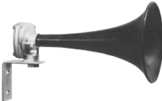
TYPE MKT 75/440